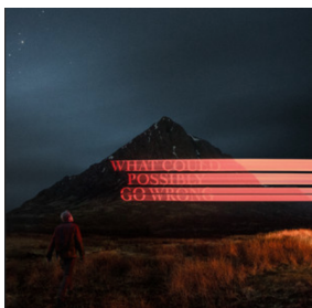
Chicken Tenders Dominic Fike