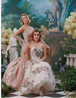
January Jones and Kiernan Shipka in Rodarte (@rodarte)