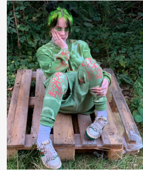
Billie Eilish (@billieeilish)