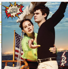
Norman fucking Rockwell Lana Del Rey