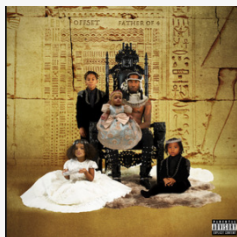
Clout Offset ft. Cardi B