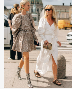
Thora Valdimars (@thora_valdimars)