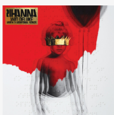
Yeah I Said It Rihanna