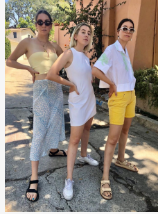
Haim Sisters (@haimtheband)