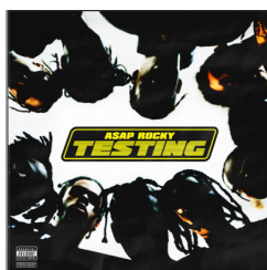
PURITY (FT. FRANK OCEAN) ASAP ROCKY

Here are the two songs I listened to the most this week! Overnight by the Parcels makes me feel like i'm living in the 70's and i'm rollerblading at a roller rink with a hot man who has a very thick moustache. Purity has always been a favorite of mine but has resurfaced in my life because I like to scream the lyrics "i've been fucking busy , i've been busy fucking" to pretend I have a life. Enjoy!