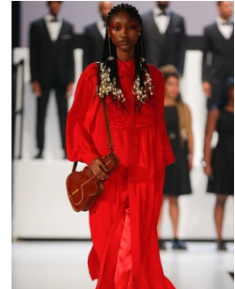
Pyer Moss (@pyermoss)

Folklore is an online concept store that brings together all types of clothes and accessories from all sorts of brands. Its mission is sourcing items made locally by artisans in South Africa, Nigeria, Ghana, and beyond.