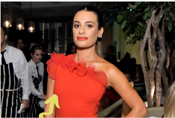
Snake in the grass