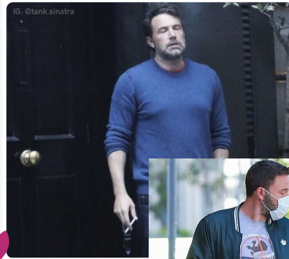
8:00 AM · Dec 26, 2016 · TweetDeck

UNILAD @UNILAD How everyone feels after spending 48 hours with family