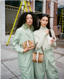
Brother Vellies (@brothervellies)

Instead of plugging 3 celebrity instagram accounts this week I am going to be sharing 3 black owned businesses that we should all support!